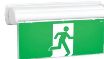
Swingblade® in wall mounted configuration

Designed in Australia to comply with the requirements of AS2293.3: 2005 and AS/NZS CISPR15: 2017.